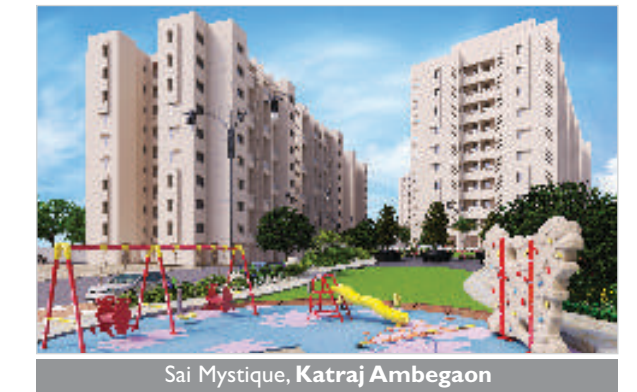
Sai Mystique, Katraj Ambegaon