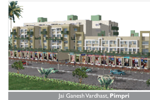
Jai Ganesh Vardhast, Pimpri