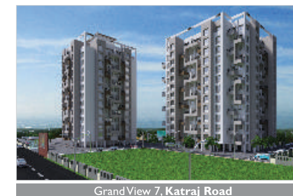
Grand View 7, Katraj Road