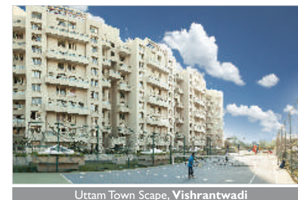
Uttam Town Scape, Vishrantwadi