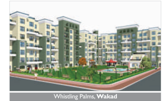
Whistling Palms, Wakad