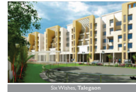
Six Wishes, Talegaon