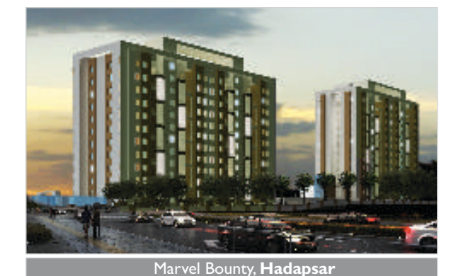
Marvel Bounty, Hadapsar