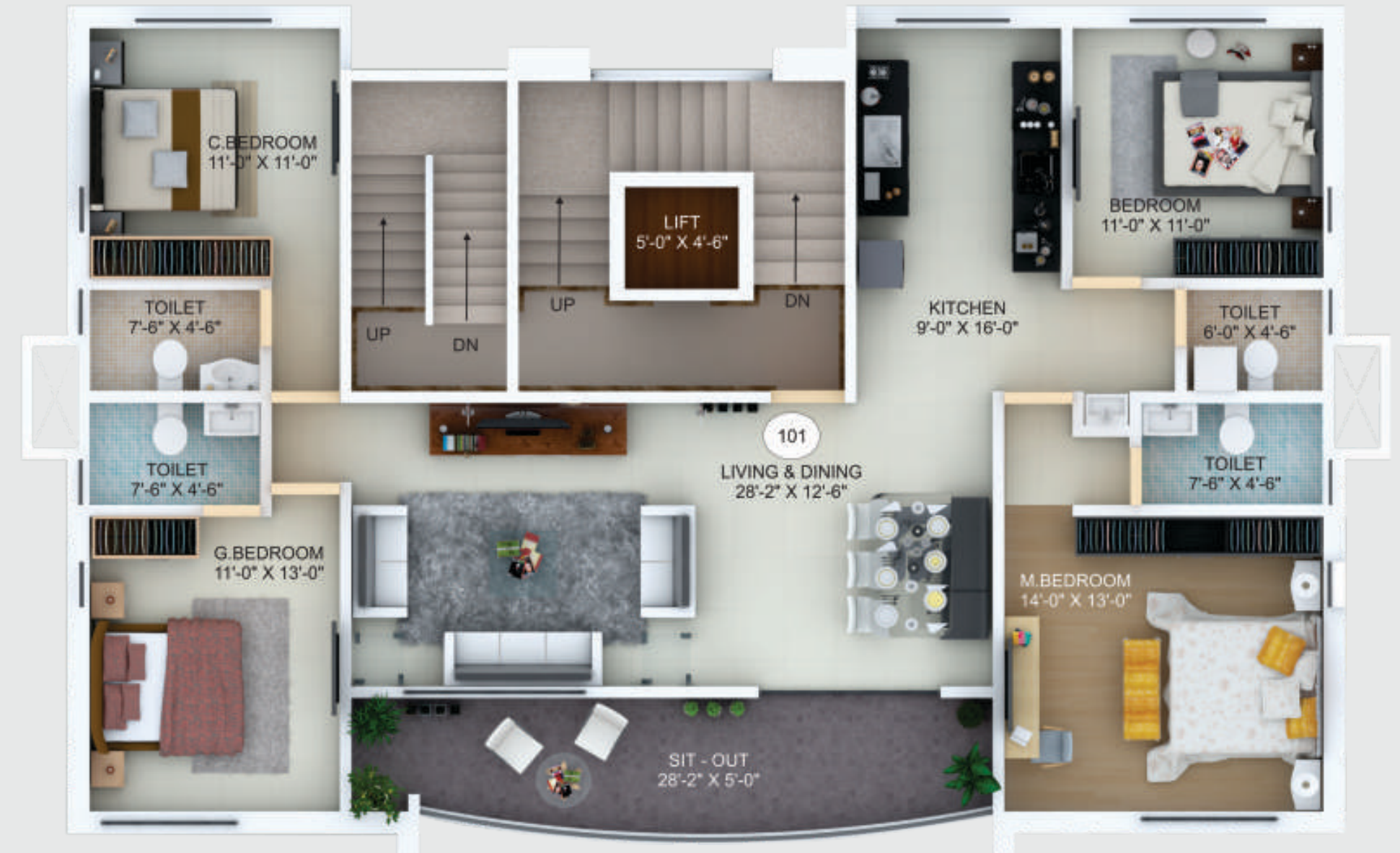
TYPICAL 1 ST TO 5 TH FLOOR PLAN