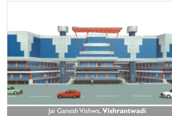
Jai Ganesh Vishwa, Vishrantwadi